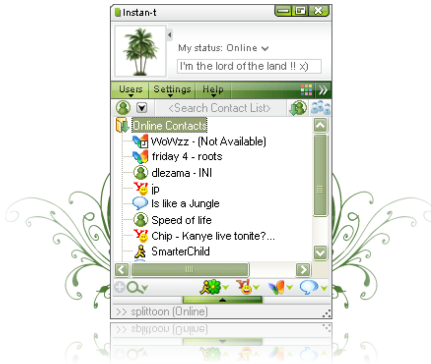
Figure 1 An example of Instant Messaging

IM is typically a one-to-one communication between two users in real-time but some IM services may allow users to invite other users to join their conversation and this may be similar to chat to the users involved. However, the main difference from chat is that IM is a user-controlled environment and the user who initiates a conversation and/or opens up the call controls who can participate.